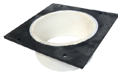
T1500-PBO2, 3, or 4 No Hub Bottom Outlet (2", 3" or 4") (specify outlet size)