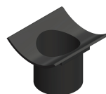
T300-PBO 2" No Hub Bottom Outlet