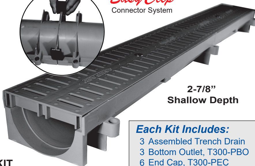
2-7/8" Shallow Depth