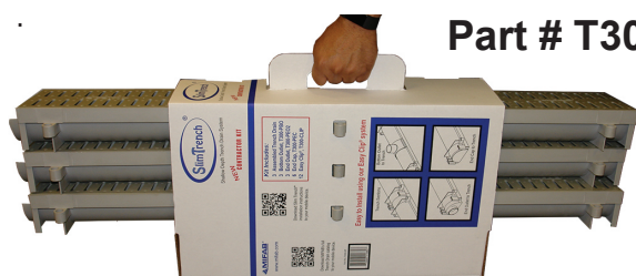
Part # T300-KIT

Our new Slim Trench® Contractor Kit is the perfect answer for dealing with residential drainage issues by pools, garages, gardens, driveways, sidewalks, patios, and kitchen areas.