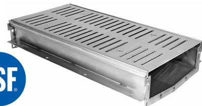
(Illustrated with Optional -FL Anchor Flange)

The P6120-LCB is NSF certified with a load classification of Medium Duty.