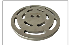
-RS Special duty slotted grate with finger holes