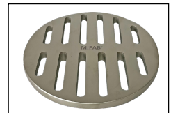
-LS Special duty slotted grate