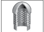
W-31-PERF and F1830-PD-3