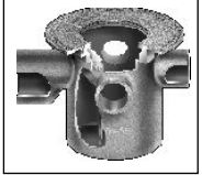
F117(*) (*) Denotes Outlet Size