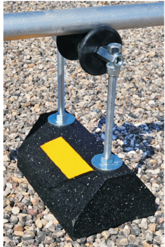
Note: CRE10-12-3 illustrated