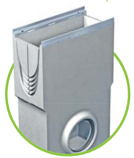
FILCOTEN® TI700 catch basin (part # TI700-CB820)