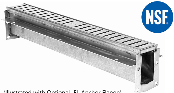
(Illustrated with Optional -FL Anchor Flange)

Note: The neoprene gasket used to connect long runs of trench drain bodies is not recommended for use with caustic or harsh chemicals. In these cases, it is recommended that the trench drain sections be welded on site.