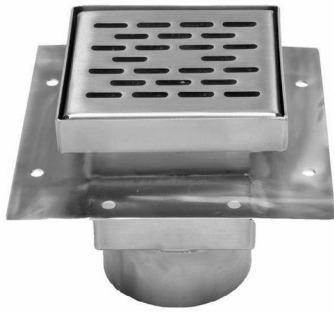
(Illustrated with Optional -FL Anchor Flange)

Note: Every order of this product is a special / custom order fabrication. This product is non returnable and noncancellable.